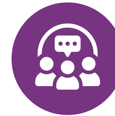
Customer and community