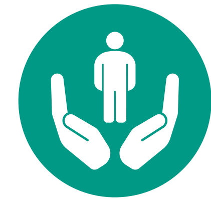
Human rights and workplace conditions