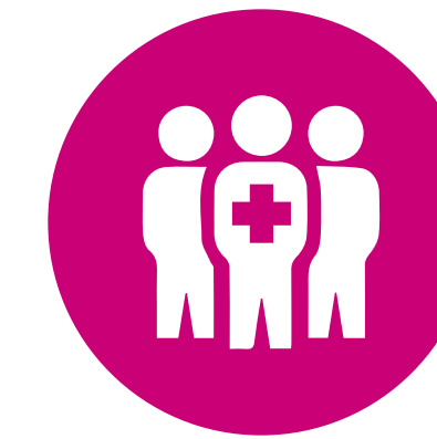
Health, safety and security