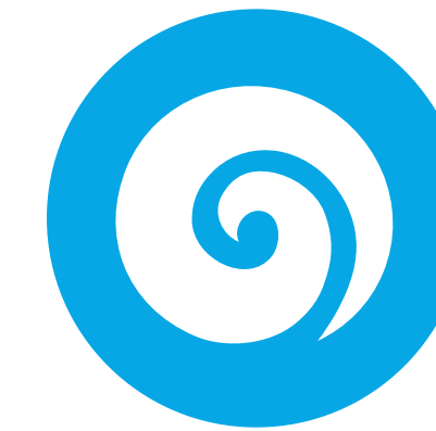
The prosperity and safety of Māori in Tāmaki Makaurau