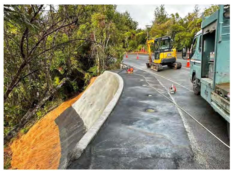
Scenic Drive, Auckland City Look-out slip repair, soil nail wall complete.

SCENIC DRIVE (NEAR TO THE AUCKLAND CITY LOOKOUT): The soil nail wall has been completed and finishing works remain (guardrail and drainage). This site is expected to be fully complete by middle of August.