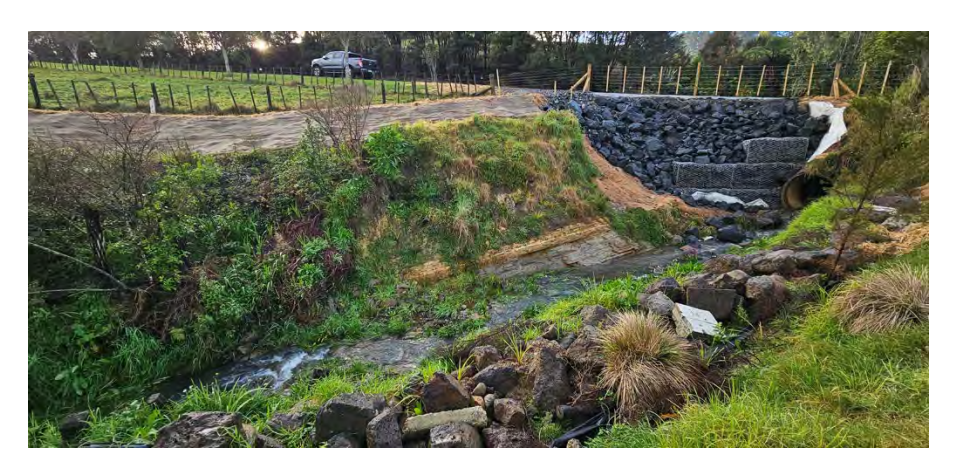
Slip repair on Gum Road Henderson Valley

> GUM ROAD, HENDERSON VALLEY: Work was started and completed in July to repair the slip near 11 Gum Road. This work included installation of Gabion baskets to stabilize the bank. The road is reopened, and the work is complete.