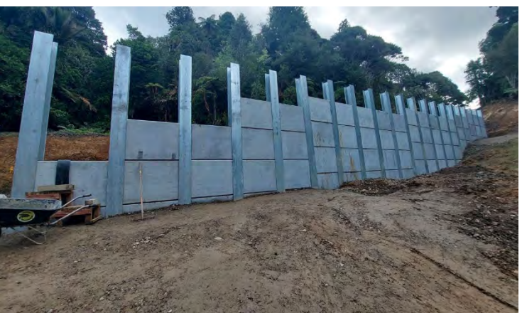
Retaining wall construction on the site on Scenic Drive, just past Arataki