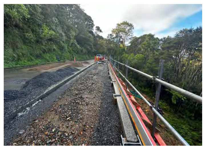
Retaining wall constructed at Titiangi end of Scenic Drive.

Site RPo.75 ( 750m from Roundabout ) – The new retaining wall is now built, and they are backfilling behind the new wall.