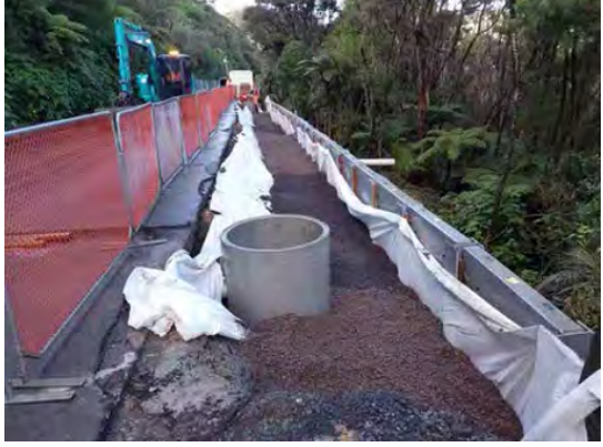
RP0.90 Scenic Drive Titirangi

Site RPo.90 (900m from the Roundabout) - The retaining wall is completed, and the team are backfilling the road.