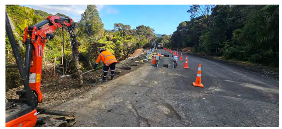
Block retaining wall almost complete

4 other sites on Bethells Road were completed in July. One large site remains to be repaired in drier months and will be programmed for the summer.