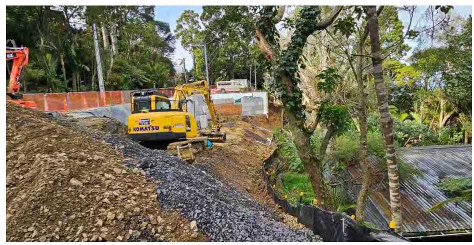
Slip repair during July on Takahe Road

TAKAHE ROAD, TITIRANGI: Works to repair the slip on Takahe Road began on Monday 17 June. The road is fully closed during the works around number 32. The work is expected to take 12 weeks to complete (weather dependent) and is currently progressing on track.