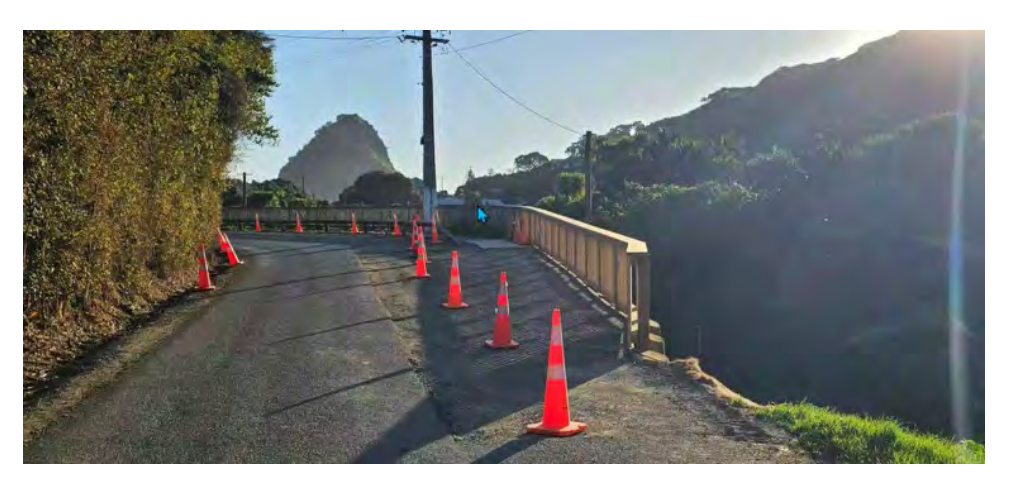
Slip repair on Glenesk Road

> GUM ROAD, HENDERSON VALLEY: Work was started and completed in July to repair the slip near 11 Gum Road. This work included installation of Gabion baskets to stabilize the bank. The road is reopened, and the work is complete.