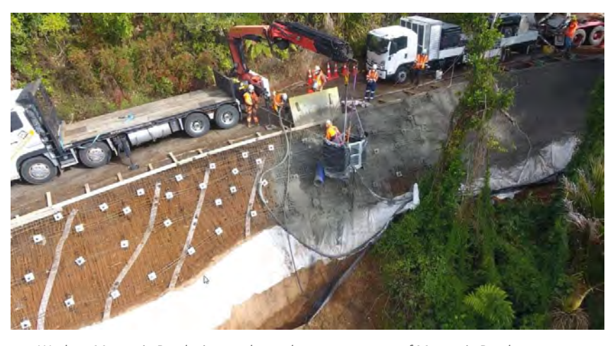
Work\ on\ Mountain\ Road-image\ shows\ the\ narrow\ nature\ of\ Mountain\ Road

MOUNTAIN ROAD: Work on Mountain Road is continuing to progress well, with roadworks underway. This includes soil nailing, and shotcreting and work is expected to continue until end of 2024. We have completed 3 sites and are currently working on the next 2 sites. Work on Mountain Road is restricted by the narrow width of the road. Logistics involved with transporting equipment can restrict how many repair activities can be carried out at the same time.