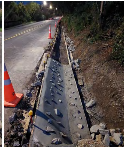
Works on Scenic Drive, North Swanson

> RP 8.25 412 SCENIC DRIVE, NEAR ARATAKI: The excavation of this site took longer than expected, with poor ground conditions. A lot of the material had to be removed from site and its condition meant that it was unable to be reused. All piling is now complete and new retaining wall built. The Contractor is now backfilling and compacting material behind the new wall before completing finishing works. Completion is now anticipated at start of September. Vector will be moving the power from temporary generator and reinstating the permanent power poles in middle of August.