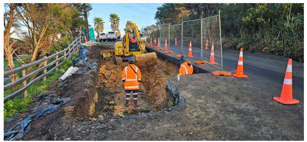
Damaged material being removed from under the pavement on Wairere Road, at Rooster Ridge.

➤ WAIRERE ROAD: Two slips will be completed early August at the "Roster Ridge" section of Wairere Road, where there is one lane closed. We expect by the end of the second week of August this section of the road will reopen to two-way traffic.