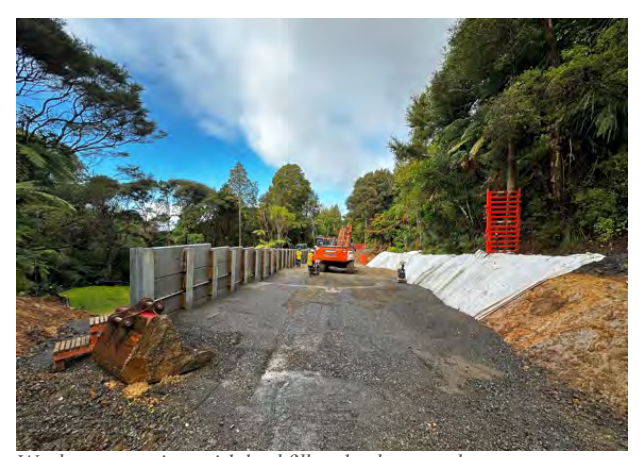
Works progressing, with backfill and culvert works.

> RP 8.25 412 SCENIC DRIVE, NEAR ARATAKI: The excavation of this site took longer than expected, with poor ground conditions. A lot of the material had to be removed from site and its condition meant that it was unable to be reused. All piling is now complete and new retaining wall built. The Contractor is now backfilling and compacting material behind the new wall before completing finishing works. Completion is now anticipated at start of September. Vector will be moving the power from temporary generator and reinstating the permanent power poles in middle of August.