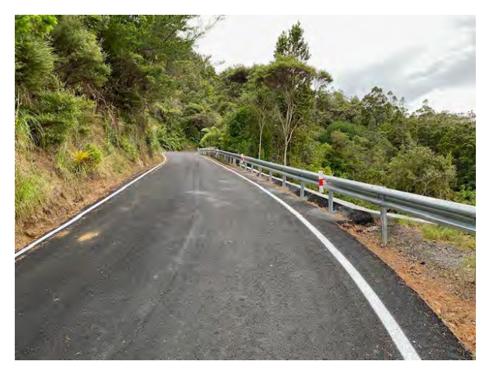
One of the completed sites on Karekare Road, Karekare

There is also rock-scaling work being completed in the next month on Karekare Road at The Cutting where rocks and debris are falling from the bank above the road. This is near the top site, which was completed earlier this year.