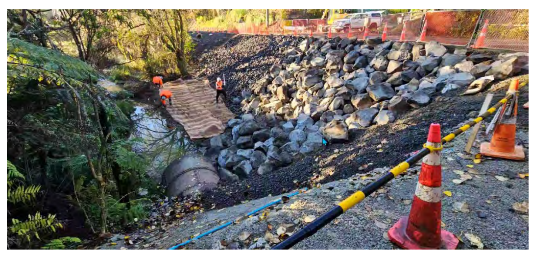
Slip repair underway on Yelash Road

YELASH ROAD, MASSEY: Construction near 13 Yelash Road in Massey is completed.