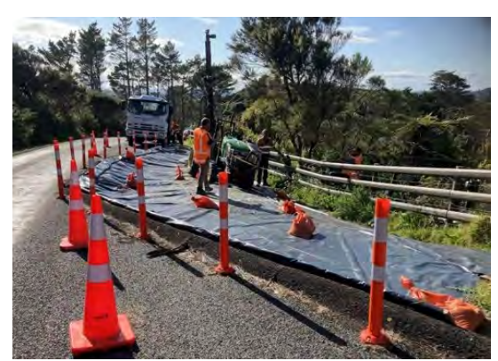
Wairere Road slip site 349 Wairere Road

We have reviewed the geotechnical testing that was completed at the large site outside 349 Wairere Road and the proposed repair involves digging out the failed section of road and reconstructing it along with upgrades to adjacent drainage. This will include a full closure of the road. This is the only access point for Wairere, Mildon, Horsman and Jonkers Roads. We are currently working with the community to establish a timetable when the road will be open for a short time during the day for vehicles to come in and out. After hours we expect the road will be open to one lane. Work is likely to commence in October.