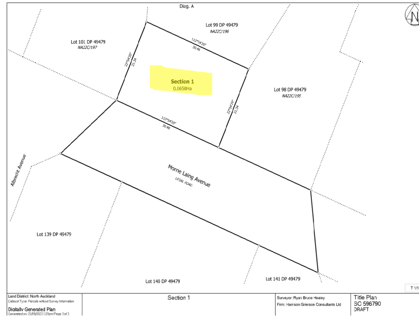
Section 1 draft Survey Office Plan 596790