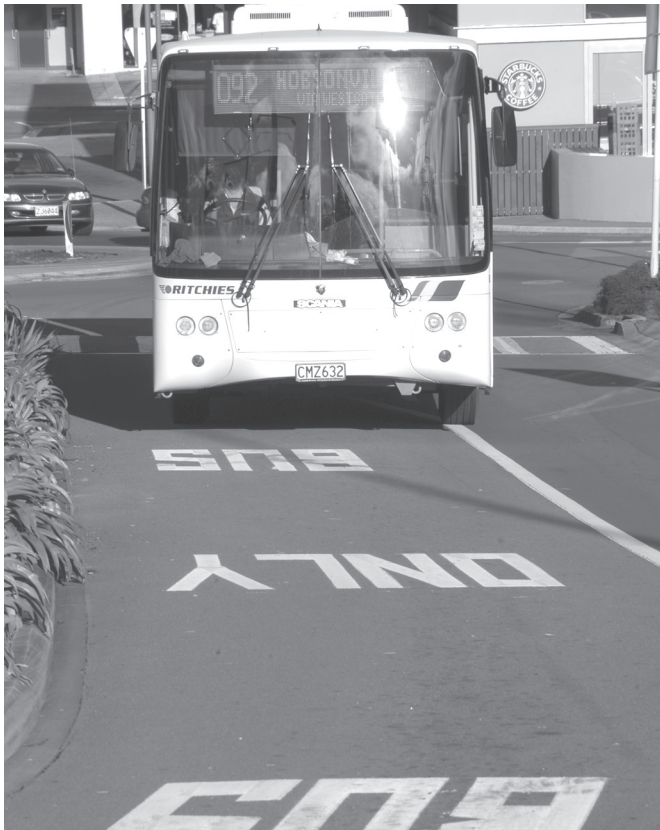
Bus advance lane, Westgate

This strategy is an affordable and sustainable approach that aims to get the best out of the existing roading network and encourage greater use of sustainable alternatives – regular walking and cycling, passenger transport, fuel-efficient vehicles, ride sharing, shorter trips, fewer trips, travelling outside peak hours and working from home.