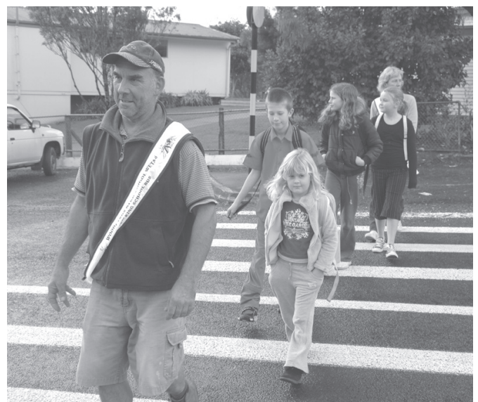
Walking school bus, Woodlands Park Primary

This strategic direction is a balanced approach to investment in roads, passenger transport, walking and cycling, and travel demand management. The strategic direction is closely aligned with the Auckland Regional Land Transport Strategy 2005. Therefore, Waitakere's transport programme has a greater likelihood of receiving funding from Land Transport New Zealand.