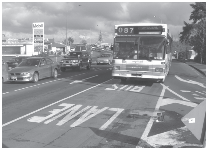
Lincoln Road bus advance lane

The Council wishes to maximise the potential of ferries by improving the precinct areas surrounding terminals, including signage, shelter, lighting, walking access and park and ride facilities. The Council will work with ARTA and operators to further develop services at West Harbour and establish new services at Hobsonville and Te Atatu.