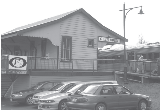
Glen Eden Rail Station and park and ride

The Council's policy is to ensure that development contributions and financial contributions are obtained and used to fund the growth requirements of the transport