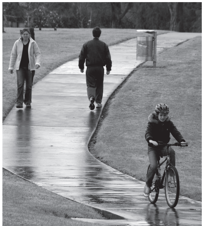
Shared path, Henderson Creek