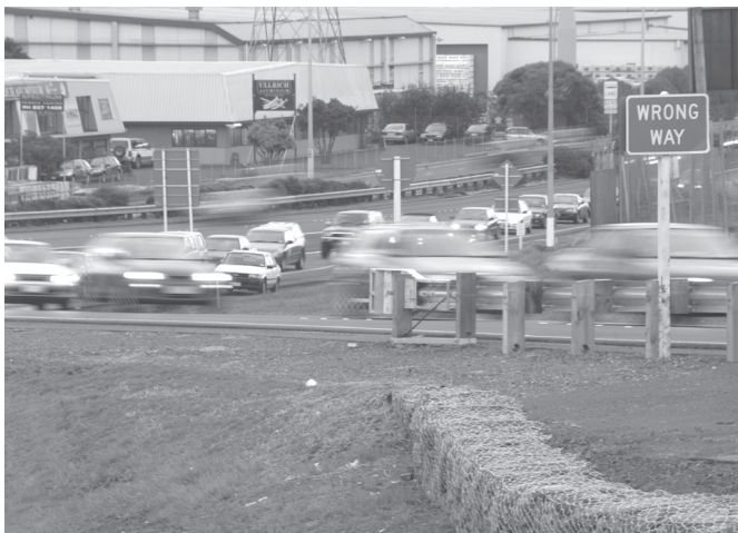
Lincoln Road off-ramp

The Council plans to investigate construction of another crossing of the Whau River between Rosebank Peninsula