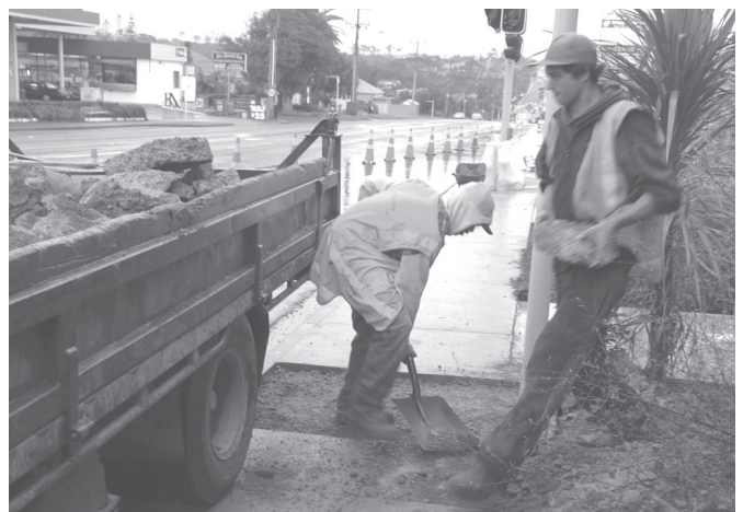
Footpath improvements, Glen Eden

Prioritisation criteria set by funding agencies will affect the timing of projects in the 10-year programme.