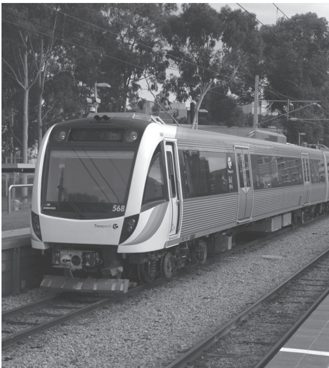
Modern train, Perth

The Council is currently developing a Waitakere Greenhouse and Energy Action Plan which will further detail projects relating to transport related greenhouse gas reduction. The Council will investigate and implement as appropriate, future opportunities to support new technologies and solutions.