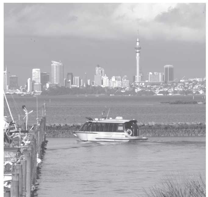
West Harbour ferry service, Westpark Marina