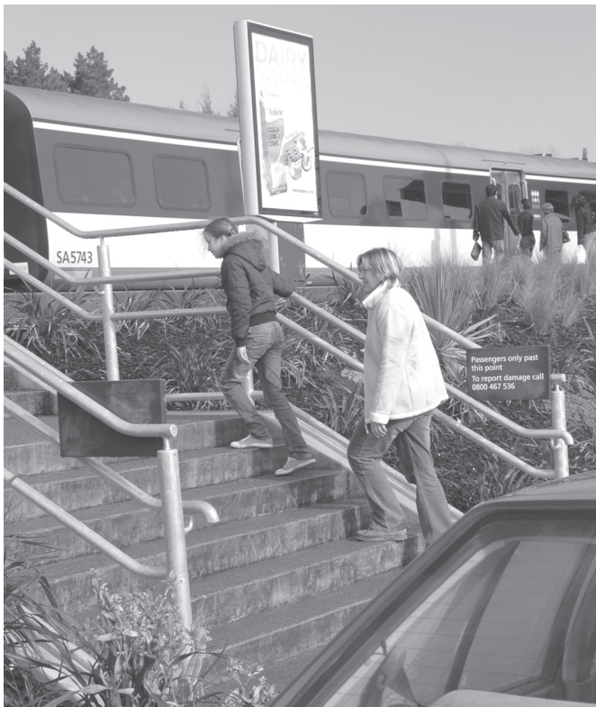
Ranui Rail Station

The Council will continue to advocate strongly for upgrade to services and infrastructure on the Western Rail Corridor.