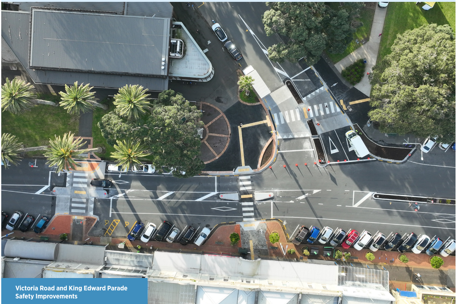
Victoria Road and King Edward Parade Safety Improvements