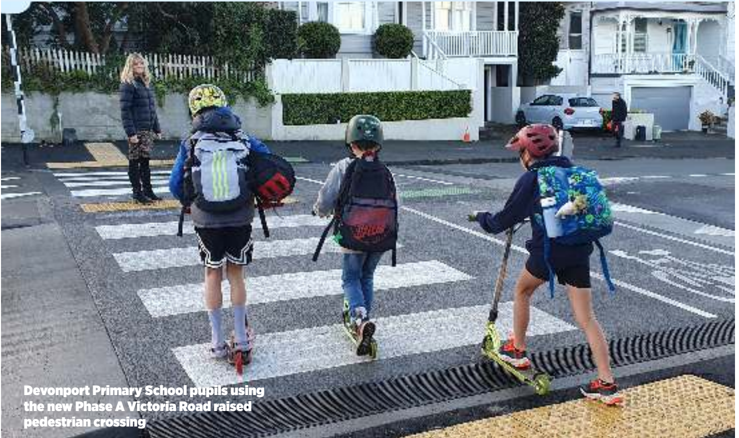
Devonport Primary School pupils using the new Phase A Victoria Road raised pedestrian crossing

We have completed the first raised table of the project (Phase A) and is already being enjoyed by Devonport Primary School pupils.