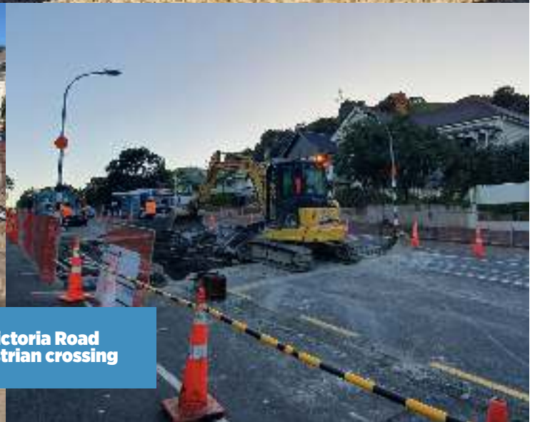
Phase A Victoria Road raised pedestrian crossing