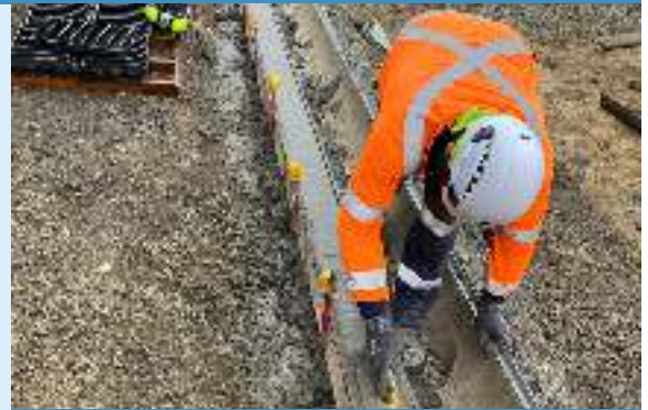
Phase A construction of concrete surround on the ACO slab drain

These sites are being constructed during the July school holidays when traffic volumes are lower.