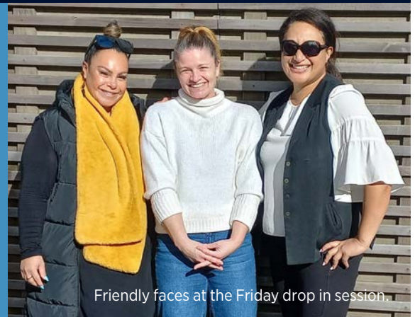
Friendly faces at the Friday drop in session.

We have a fortnightly drop-in space outside Mövenpick where you can get up to date information about the project or come and chat to us. Auckland Transport and Fulton Hogan project staff will be available on every second Friday to answer your questions and queries about the works (weather dependent during winter months). The next drop-in sessions are planned on 9 and 23 September 2022 to answer your questions and queries. If you are in the area at this time please come and say hello. We'd love to see you.