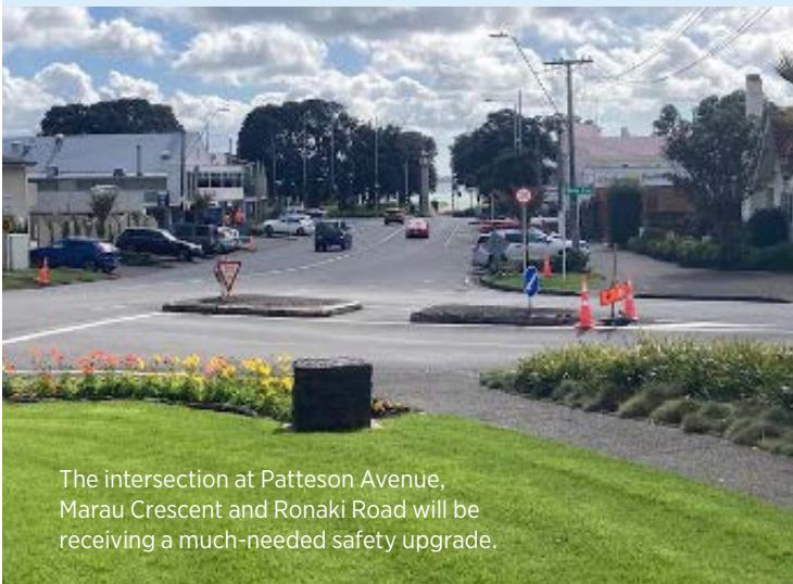
The intersection at Patteson Avenue, Marau Crescent and Ronaki Road will be receiving a much-needed safety upgrade.

In September, works will also commence for Phase F; intersection of Patteson venue and Marau Crescent. The scope includes providing new crossing facilities to improve the safety of this area for pedestrians, cyclists and road users. The works would again involve drainage, footpath, islands, raised speed table, and street lighting.