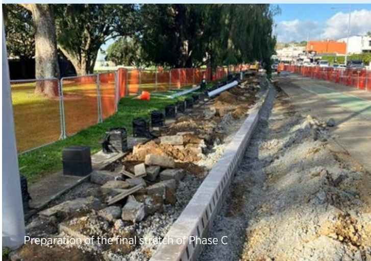
Preparation of the final stretch of Phase C

Phase C is almost completed with the team continuing to take advantage of the recent sunny weather to lay the new asphalt footpath for the final stretch; from the Atkin Ave/Tāmaki Drive intersection to the clock tower. During the past month the crew have found working in the very wet weather to be a challenge but have kept the works progressing while ensuring work on the new separated footpath and cycle lane is 'top notch'.