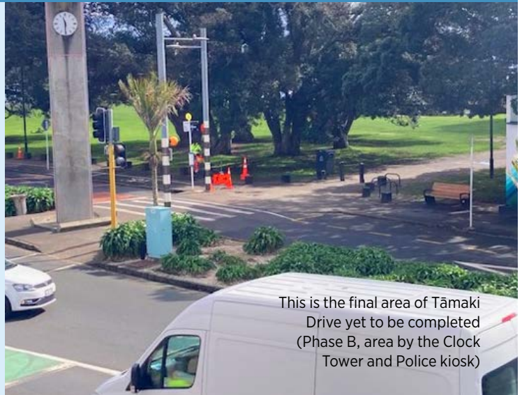
This is the final area of Tāmaki Drive yet to be completed (Phase B, area by the Clock Tower and Police kiosk)

From the end of August and into September we will be working on Phase B. The scope of Phase B is to install a wider shared path on the sea side. The works include upgrading drainage and pavement along the slip lane, realigning kerbs and installing new bus shelter and cycle racks.