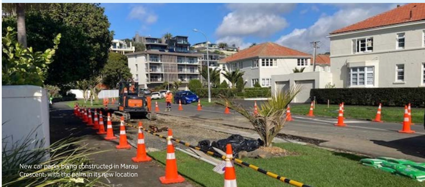
New car parks being constructed in Marau Crescent, with the palm in its new location

Reduced Speeds in Mission Bay - Existing & Proposed (vimeo.com)