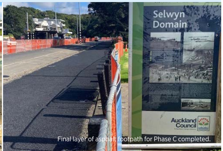
Final layer of asphalt footpath for Phase C completed.