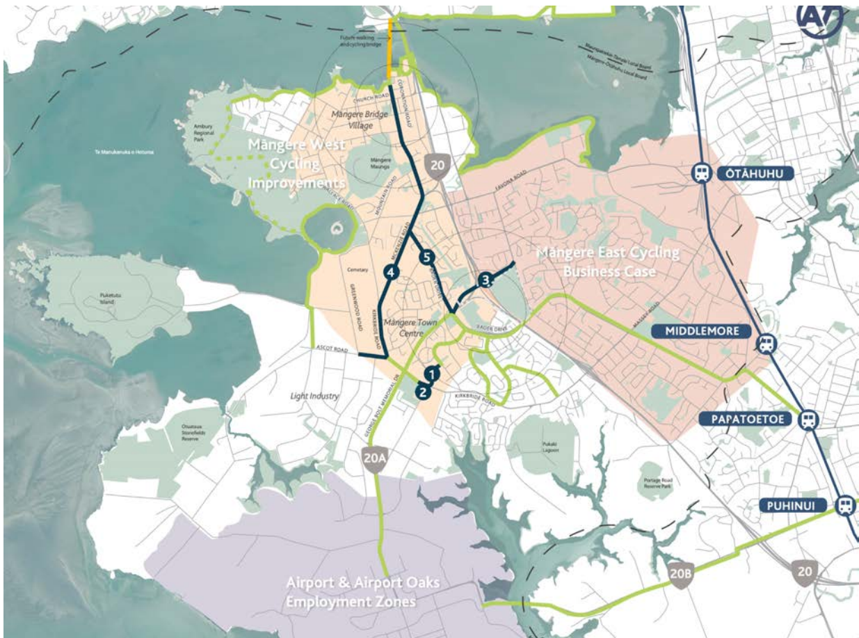
Map of the project area. The links numbered 1-5 are those proposed during the 2020 consultation. The Collaboration Forum process may result in changes to these.

In 2020, AT consulted communities in Māngere West on the proposed cycling improvements. During this consultation, some groups within the community indicated they wanted more involvement in developing proposed cycling improvements. In response, AT restarted the project in 2021 to work more closely with communities in Māngere and Māngere Bridge to develop options for cycling connections, so trips to work, schools and town centres are easier and safer by bike.