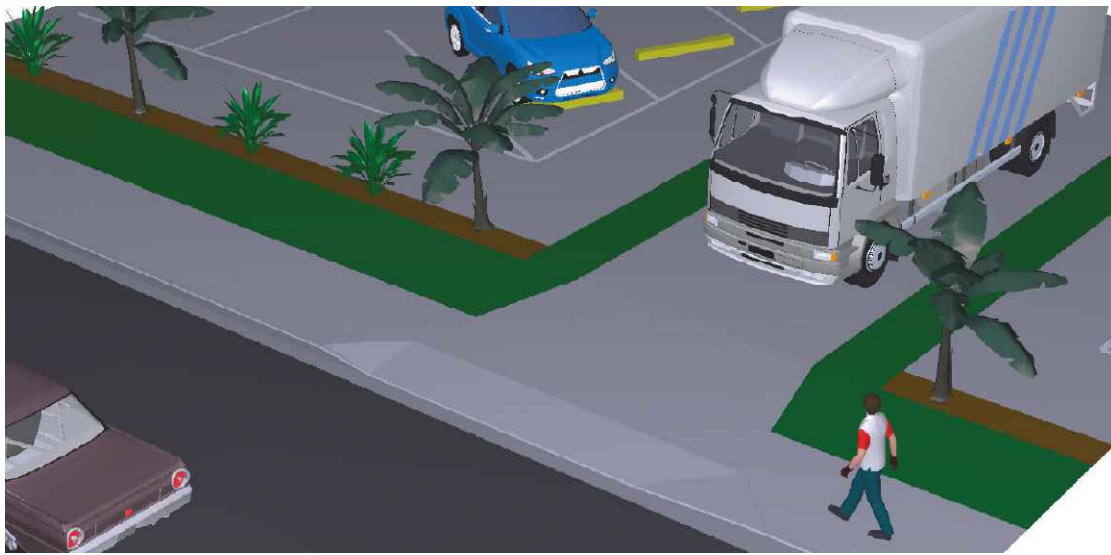
PERSPECTIVE VIEW N.T.S