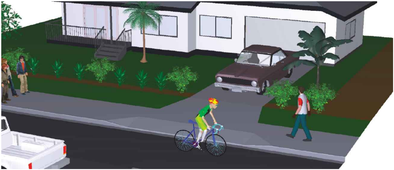
PERSPECTIVE VIEW N.T.S