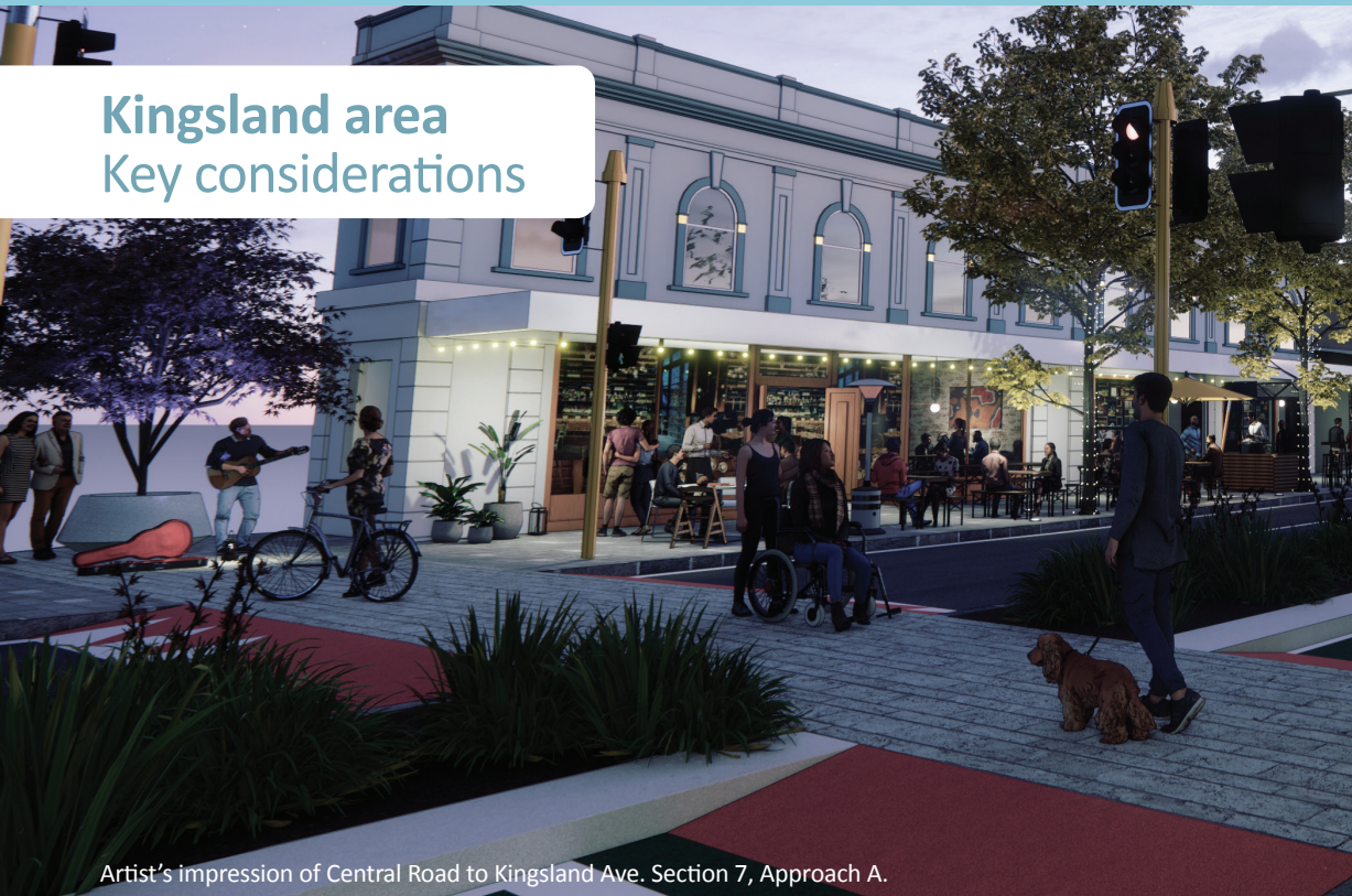
Artist's impression of Central Road to Kingsland Ave. Section 7, Approach A.