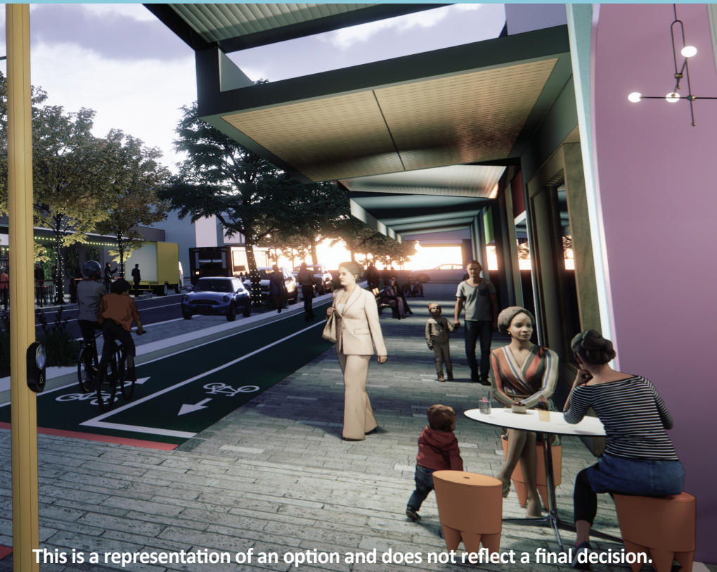
This is a representation of an option and does not reflect a final decision.

Bordered by light industrial on the city side and the suburb of Morningside on the other, Kingsland benefits from a strong railway connection. But there is conflict from limited space and congestion as traffic increases nearer the Town Centre.