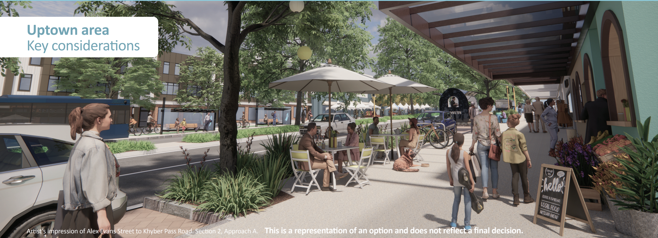
Artist's impression of Alex Evans Street to Khyber Pass Road. Section 2, Approach A. This is a representation of an option and does not reflect a final decision.

Uptown covers the Newton area which New North Road runs through.