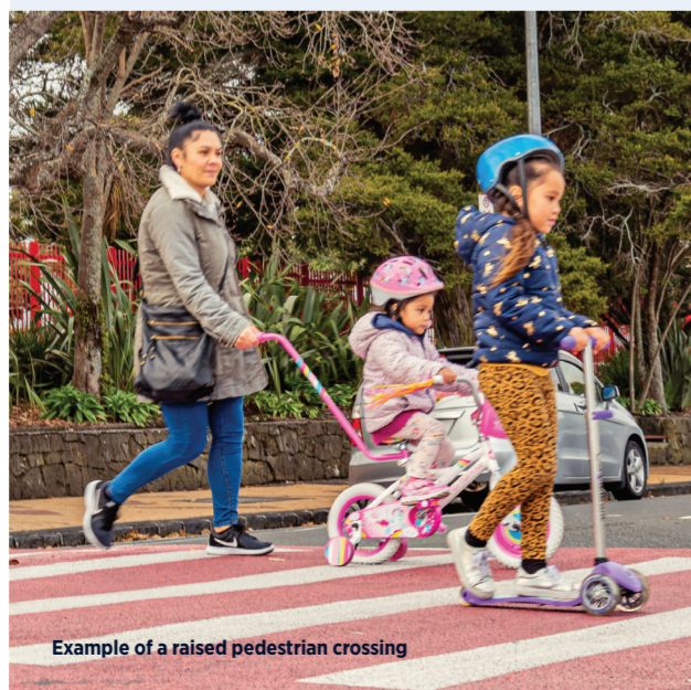
Example of a raised pedestrian crossing

Public feedback is open until Sunday 21st November 2021.