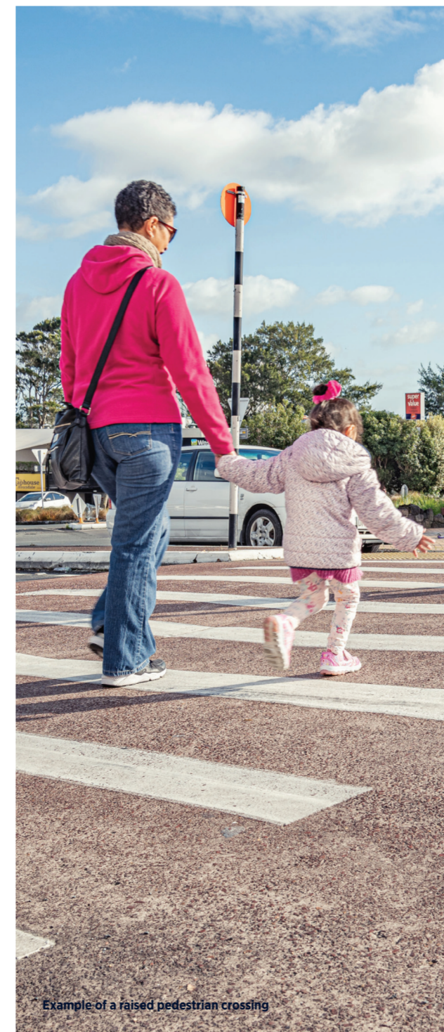
Example of a raised pedestrian crossing

Survivability rates vary significantly based on a number of factors and scenarios. AT takes a preventative approach with respect to the survivability of our most vulnerable road users. Data taken from Research Report AP-R560-18 published in March 2018 by Austroads - the Association of Australian and New Zealand Road Transport and Traffic Authorities.